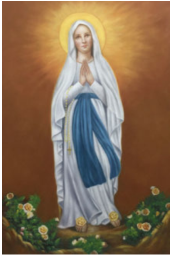
OUR LADY OF LOURDES Feast Day— February 11

This title is given to the Virgin Mary due to her apparitions that occurred in Lourdes, France on Feb 11, 1858 to 14 year old Bernadette Soubirous, in the cave of Massabielle while she was gathering firewood. Our Lady was wearing a white dress, a blue girdle and a yellow rose on each foot, the same color as the chain of Her Rosary. There were 18 reported apparitions from Feb 11 - July 16, 1858. It was on the 16 th apparition that She said "I am The Immaculate Conception." Our Lady instructed Bernadette to dig in the ground nearby, from which came a spring with healing properties, active to this day.