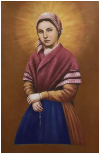
ST. BERNADETTE Feast Day— April 16 ( in France on February 18 )

St. Bernadette of Lourdes, original name Marie-Bernarde Soubirous, was born on Jan 7, 1844, in Lourdes, France. She came from a very poor family and was the oldest of 9 children. As a young teenager, she had a series of visions of the Virgin Mary in the Massabielle grotto, ultimately leading to the founding of the Shrine of Lourdes.