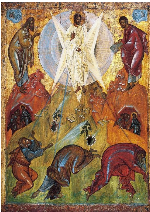
Icon by Theophanes the Greek, 15 th century

The Transfiguration also echoes the teaching by Jesus (as in Matthew 22:32) that God is not "the God of the dead, but of the living". Although Moses had died and Elijah had been taken up to heaven centuries before (as in 2 Kings 2:11), they now live in the presence of the Son of God, implying that the same return to life applies to all who face death and have faith.