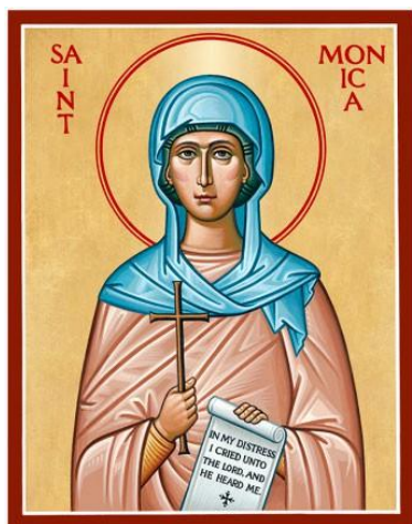
ST. MONICA (322-387) AUGUST 27