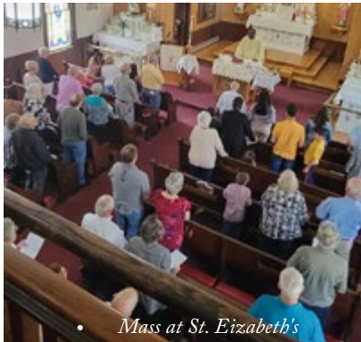
• Mass at St. Elizabeth's

The parish office will be closed Monday, May 29 in observance of Memorial Day.