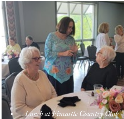
• Lunch at Fincastle Country Club