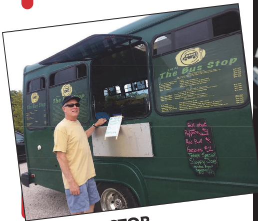
THE BUS STOP

(rain or shine) Saint Paschal Parking Lot