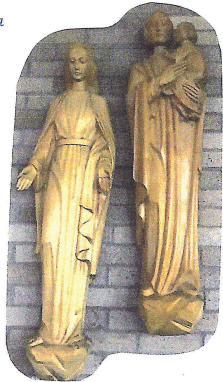
Wood carvings of Mary and Joseph with the Child Jesus on the North wall of Our Lady of the Blessed Sacrament Chapel