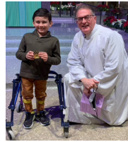
PHOTO: Another one of our students received their First Penance this February. Plan on attending our Penance Service, this Tuesday at 1:00 p.m., or Monday, April 4 or Tuesday, April 5 at 6:30 p.m., or any time on Saturdays from 3:30-4:15 p.m., or any time with a priest in the parish office confessional.

he wanted to savor the moment on Mount Tabor and be with the glory at that site. Instead, we take the glory, leave the mountain top experience, and bring that to others. We are called, as the chosen, to be just as dazzling: living our faith in all its glory. Who have you shared your faith with lately? It could be in an unexpected place, in line, at the restaurant, car wash or any number of other places. This is not the time to stay silent; bring folks to the glory of our Church, gather around the altar, and take in the glory of God through our Eucharistic meal. We will be transfigured by it!