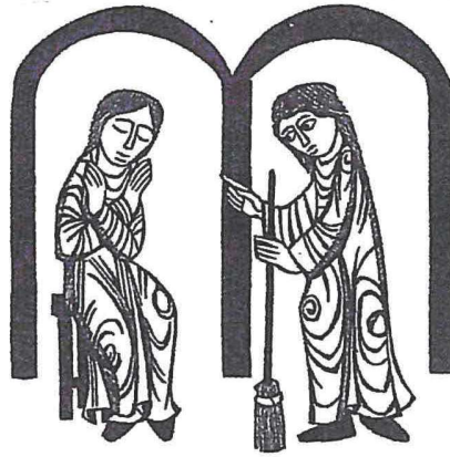
Mary & Martha

Have you ever had a day in which nothing you did was right? That seems to be how Martha felt in today's Gospel. For the modern audience, everything Martha does in the story seems correct. And the ancient audience would have agreed. Martha welcomes Jesus into her house and does exactly what a woman in ancient Palestine would have done; she waits on him and offers appropriate hospitality. In many parts of the Greco-Roman Empire this was standard procedure. Men in the household would visit with the guests, but women not as commonly. So, based on the standards of her own culture, Martha is justified in being angry at her sister, Mary. After all, this is her house. Martha's plea to Jesus as a religious teacher suggests that she expects him to agree with her and conventional wisdom.