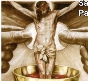
Saint Paschal Baylon Parish