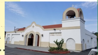
Christ the King