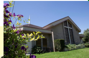
Our Lady of Refuge