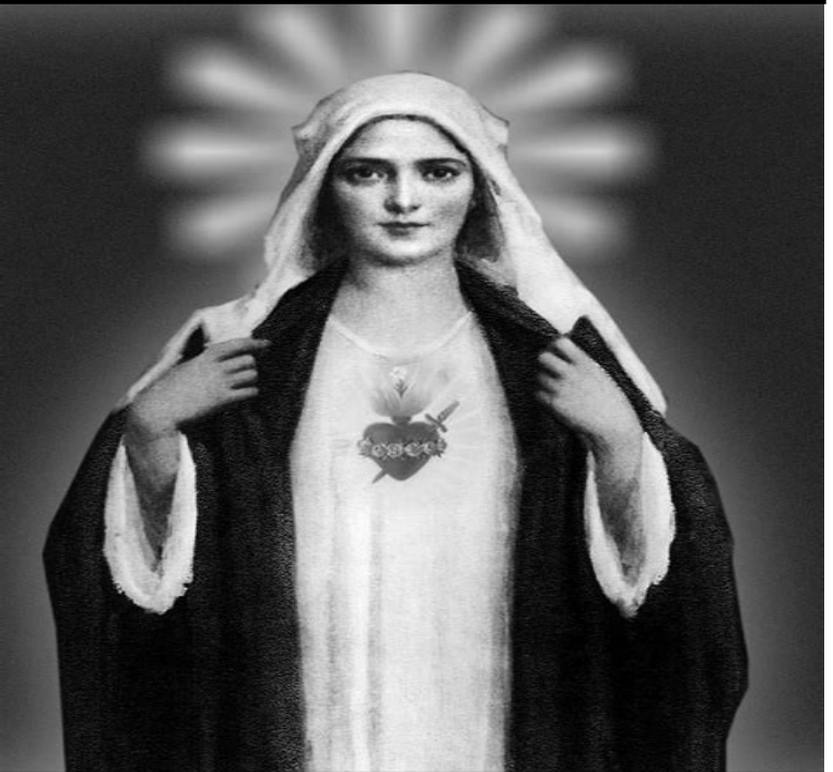
AUGUST—THE MONTH OF THE IMMACULATE HEART OF MARY