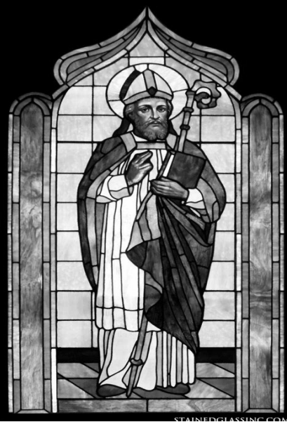
St. Gregory the Great - Sept. 03