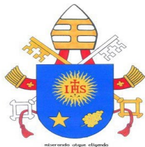
Pope Francis Rome, Italy

Visit us at: www.saintann-somerville.org