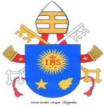
Pope Francis Rome, Italy

Visit us at: www.saintann-somerville.org