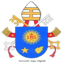
Pope Francis Rome, Italy

Visit us at: www.saintann-somerville.org