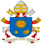
Pope Francis Rome, Italy

Visit us at: www.saintann-somerville.org