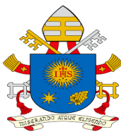
Pope Francis Rome, Italy

Visit us at: www.saintann-somerville.org