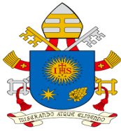
Pope Francis Vatican City

Visit us at: www.saintann-somerville.org