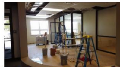
New Office Space