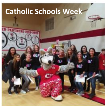
Catholic Schools Week