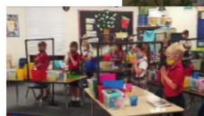
A New School Year Begins