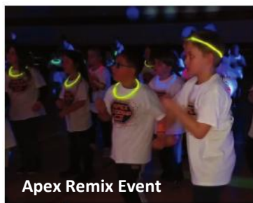
Apex Remix Event