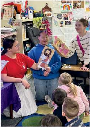
The children in our parish prepared for Lent with a puppet show and Lenten prayer activity.