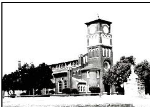
St. Mary's Catholic Church Windthorst, TX