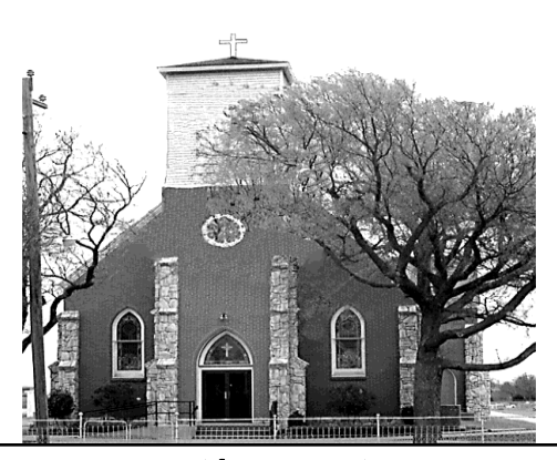
St. Boníface Catholíc Church Scotland, TX

To serve Christ and promote His teachings through Worship, Education, Training, Service, and Community Involvement