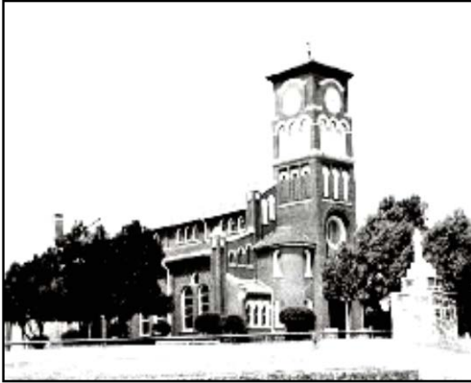
St. Mary's Catholic Church Windthorst, TX

To serve Christ and promote His teachings through Worship, Education, Training, Service, and Community Involvement