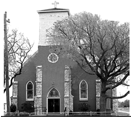
St. Boniface Catholic Church Scotland, TX

To serve Christ and promote His teachings through Worship, Education, Training, Service, and Community Involvement