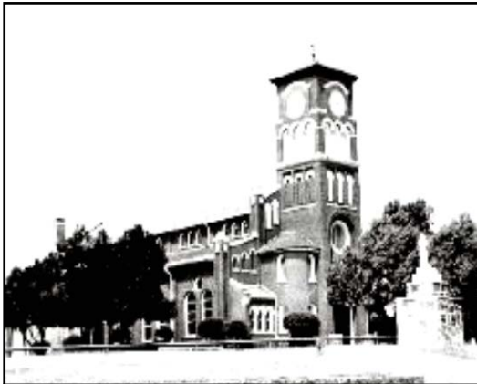
St. Mary's Catholic Church Windthorst, TX