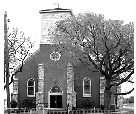
St. Boniface Catholic Church Scotland, TX

To serve Christ and promote His teachings through Worship, Education, Training, Service, and Community Involvement