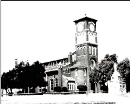
St. Mary's Catholic Church Windthorst, TX

To serve Christ and promote His teachings through Worship, Education, Training, Service, and Community Involvement