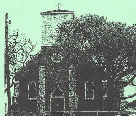
St. Boniface Catholic Church Scotland, TX

To serve Christ and promote His teachings through Worship, Education, Training, Service, and Community