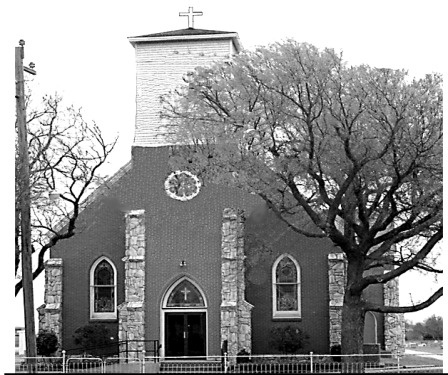
St. Boniface Catholic Church Scotland, TX

To serve Christ and promote His teachings through worship, Education, Training, Service, and Community Involvement