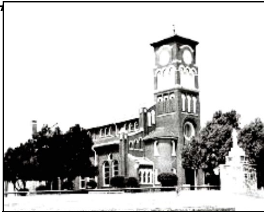
St. Mary Catholic Church Windthorst, TX