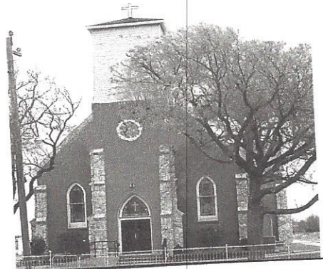
St. Boniface Catholic Church Scotland, TX

To serve Christ and promote His teachings through Worship, Education, Training, Service, and COURAGEOUSNESS