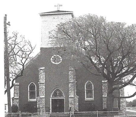
St. Boniface Catholic Church Scotland, TX

To serve Christ and promote His teachings through Worship, Education, Training, Service, and Community