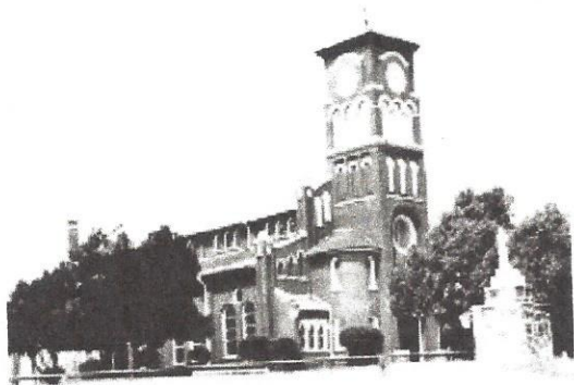
St. Mary Catholic Church Windthorst, TX