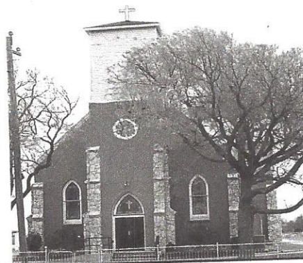
St. Boniface Catholic Church Scotland, TX

To serve Christ and promote His teachings through Worship, Education, Training, Service, and Community