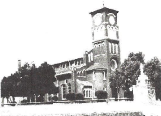
St. Mary Catholic Church Windthorst, TX