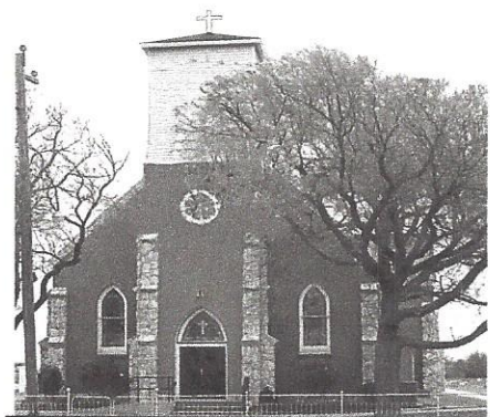
St. Boniface Catholic Church Scotland, TX

To serve Christ and promote His teachings through Worship, Education, Training, Service, and Caring Ministry