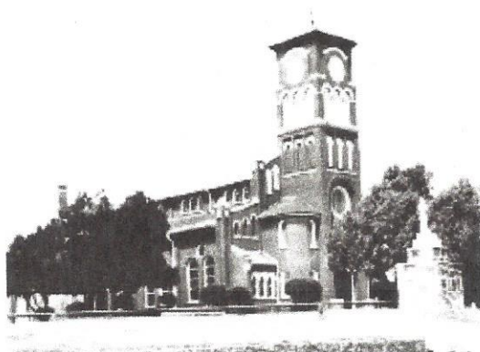
St. Mary Catholic Church Windthorst, TX