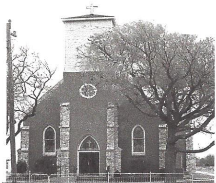
St. Boniface Catholic Church Scotland, TX

To serve Christ and promote His teachings through Worship, Education, Training, Service, and Community