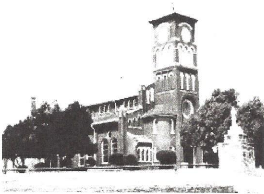
St. Mary Catholic Church Windthorst, TX