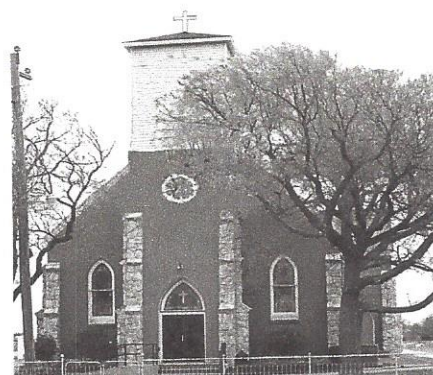
St. Boniface Catholic Church Scotland, TX

To serve Christ and promote His teachings through worship, Education, Training, Service, and Community