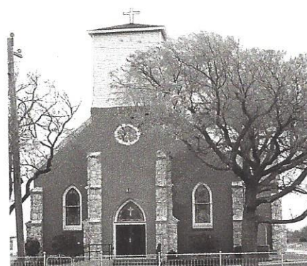
St. Boniface Catholic Church Scotland, TX

To serve Christ and promote His teachings through Worship, Education, Training, Service, and Community