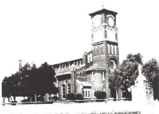
St. Mary Catholic Church Windthorst, TX