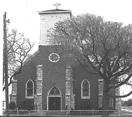
St. Boniface Catholic Church Scotland, TX

To serve Christ and promote His teachings through Worship, Education, Training, Service, and Community Involvement