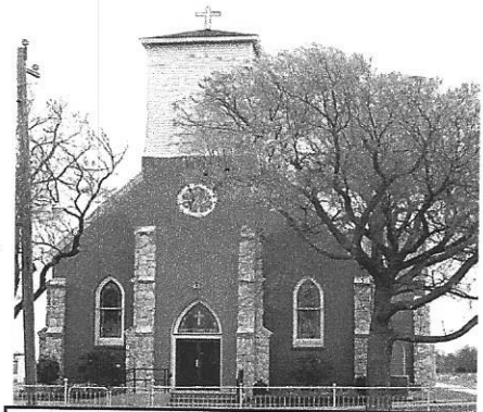
St. Boniface Catholic Church Scotland, TX

To serve Christ and promote His teachings through Worship, Education, Training, Service, and Community Involvement