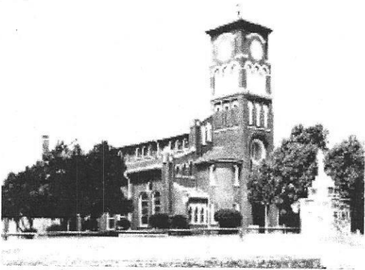
St. Mary Catholic Church Windthorst, TX

To serve Christ and promote His teachings through Worship, Education, Training, Service, and Community Involvement