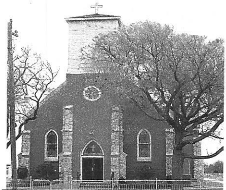
St. Boniface Catholic Church Scotland, TX

To serve Christ and promote His teachings through Worship, Education, Training, Service, and Community Involvement