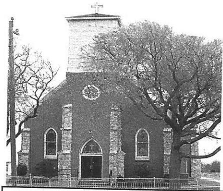
St. Boniface Catholic Church Scotland, TX

To serve Christ and promote His teachings through worship, Education, Training, Service, and Community Involvement