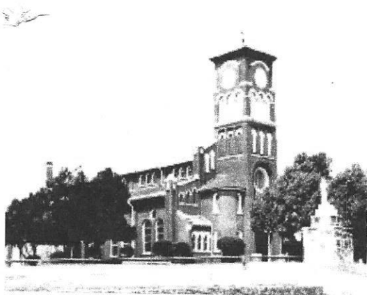
St. Mary Catholic Church Windthorst, TX