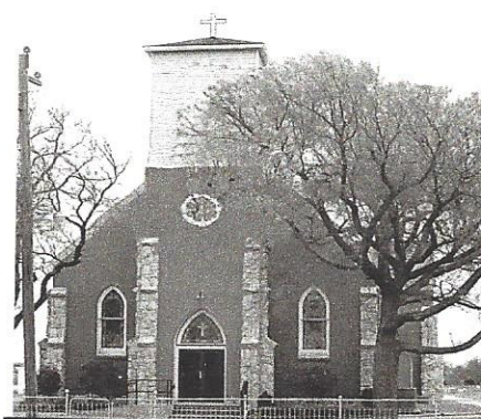
St. Boniface Catholic Church Scotland, TX

To serve Christ and promote His teachings through worship, Education, Training, Service, and Community Involvement