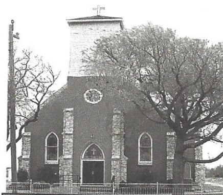
St. Boniface Catholic Church Scotland, TX

To serve Christ and promote His teachings through Worship, Education, Training, Service, and Community Involvement