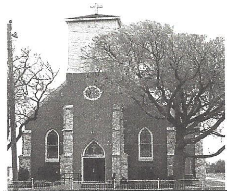
St. Boniface Catholic Church Scotland, TX

To serve Christ and promote His teachings through Worship, Education, Training, Service, and Community Involvement