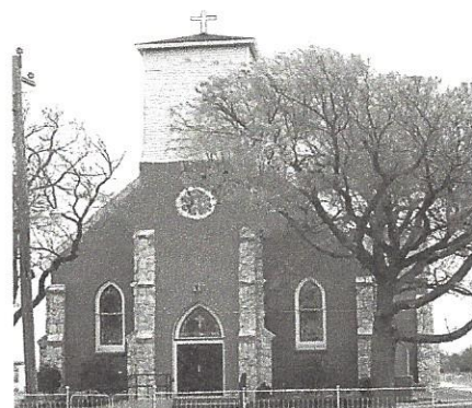
St. Boniface Catholic Church Scotland, TX

To serve Christ and promote His teachings through worship, Education, Training, Service, and Community Involvement