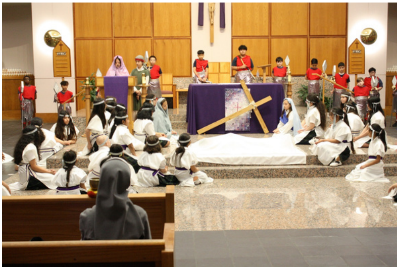
A scene from the HFCA student presentation of the Living Stations

We are God's children building His kingdom with joyful hearts filled with faith, compassion, kindness, love, and a desire for learning.