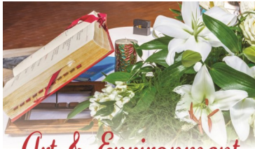
Art & Environment