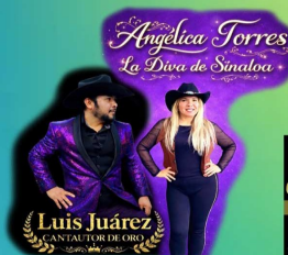
3:00pm ~ 3:30pm