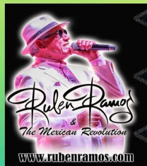
8:30pm ~ 10:00pm