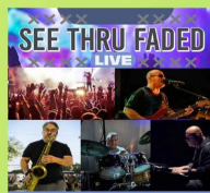
1:30pm ~ 2:30pm