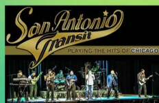
6:00pm ~ 7:30pm