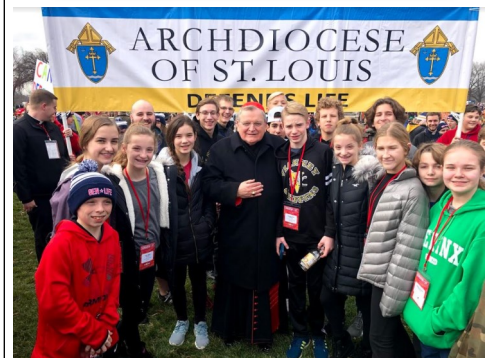
Some of our 8th graders with former St. Louis Archbishop, Cardinal Burke!