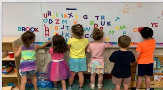
Pre-K Class, 2021

Sunday: 7:30 a.m./9 a.m. 10:30 a.m./Noon/ 6 p.m. Saturday: 8 a.m./5 p.m. Mon.-Fri.: 6:30 a.m./8 a.m.