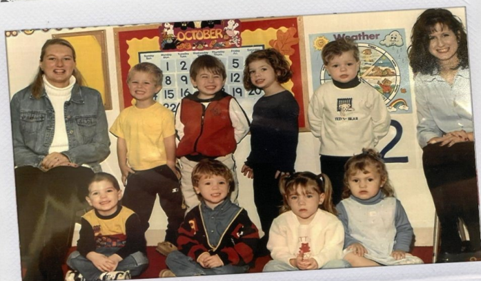
1st Pre-K Class, 2001

Happy 20th Anniversary to the Assumption Early Learning Center !