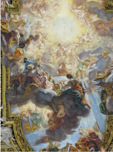
(il Gesu, Rome, detail of the ceiling)

Music, poetry, art — all these strain toward heaven as well, yet are ultimately frustrated in their deficiency. But with humility, and by the grace of God, let us at least try, so to provide some grist for a fruitful and encouraging contemplation.