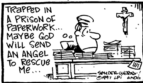
PETER AND PAUL, APOSTLES